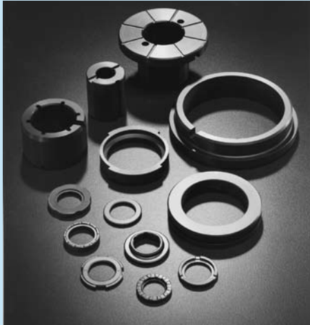
Typical sealface and bearing components currently fabricated in Hexoloy® SP SiC