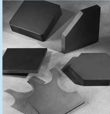
Ceramic Tile Components