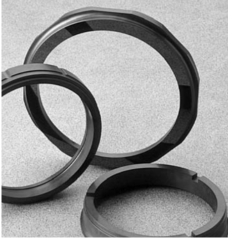
Noralide® NBD-200 Hot Pressed Silicon Nitride

Saint-Gobain Ceramics Structural Ceramics Hexoloy® Products 23 Acheson Drive Niagara Falls, NY 14303 Tel: 716-278-6233 Fax: 716-278-2373 e-mail: scd.sales@saint-gobain.com www.carbo.com