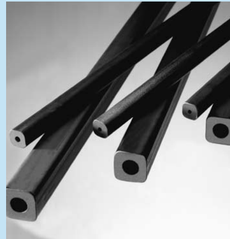
Hexoloy® SE SiC Beams