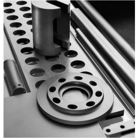
Hexoloy® SA SiC

See the table inside for typical properties of these materials. Saint-Gobain Ceramics application engineers can assist you with the design of cost-effective high performance components for your specific need.